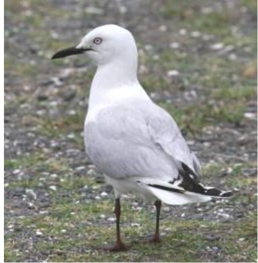
Black-billed Gull (Tarapunga) Larus bulleri