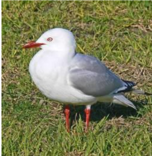
Red-billed Gull (Tarapunga or Akiaki) Larus novaehollandiae