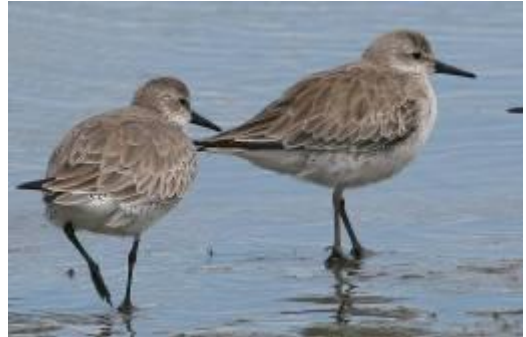
Red or Lesser Knot (Huahou) Calidris canutus