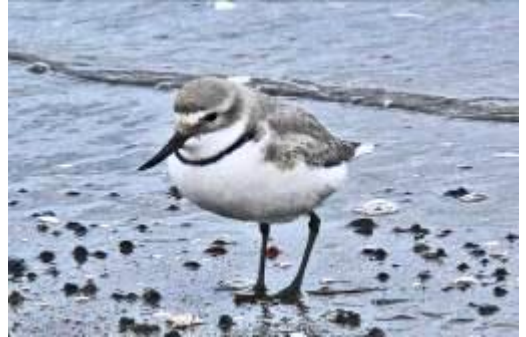
Wrybill (Ngutuparore) Anarhynchus frontalis