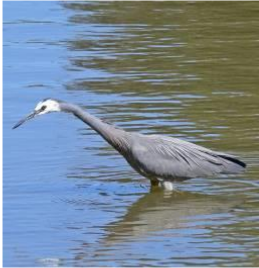
White-faced Heron (Matuku-moana) Ardea novaehollandiae