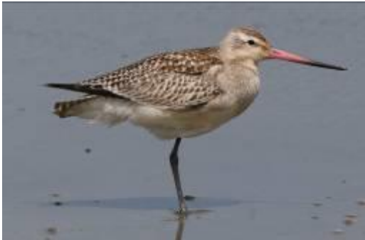
Bar-tailed Godwit (Kuaka) Limosa lapponica