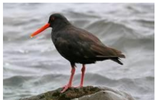
Variable Oystercatcher (Toreapango) Haematopus unicolor