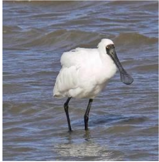
Royal Spoonbill (Kotuku-ngutupapa) Platalea regia