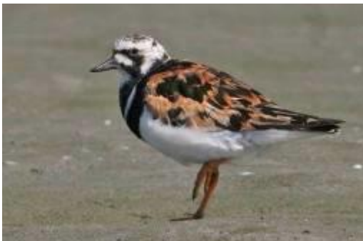
Turnstone Arenaria interpres