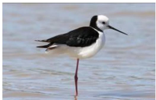
Pied Stilt (Poaka) Himantopus himantopus