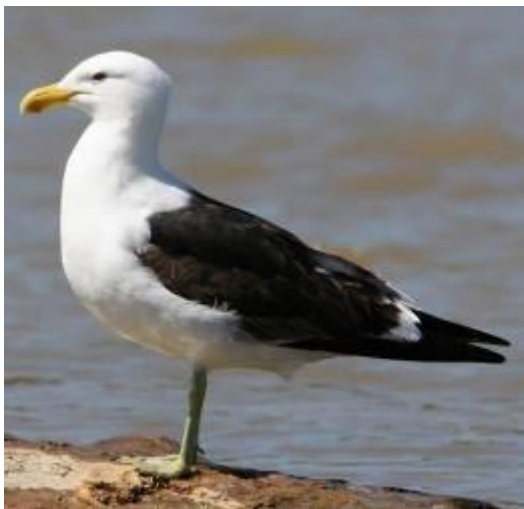
Black-backed Gull (Karoro) Larus dominicanus