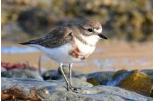
Banded Dotterel (Tuturiwhatu) Charadrius bicinctus