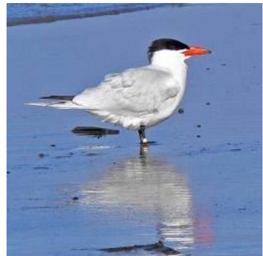
Caspian Tern (Taranui) Sterna caspia