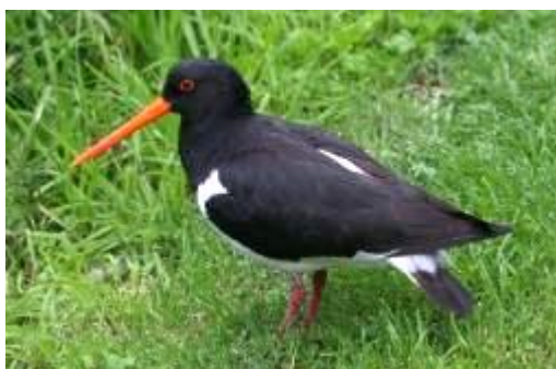
Pied Oystercatcher (Torea) Haematopus ostralegus