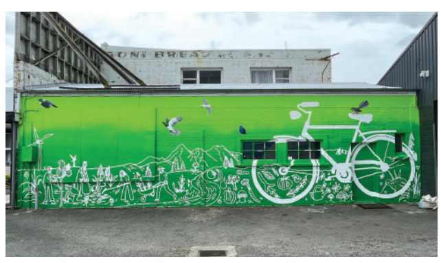
increased awareness of our presence in Palmerston North's central business district.

The mural is a mix of vibrant greens, Joe's trademark native birds and drawings of the hive of activities and initiatives that our member groups, collectives and projects participate in. It represents us and has strongly